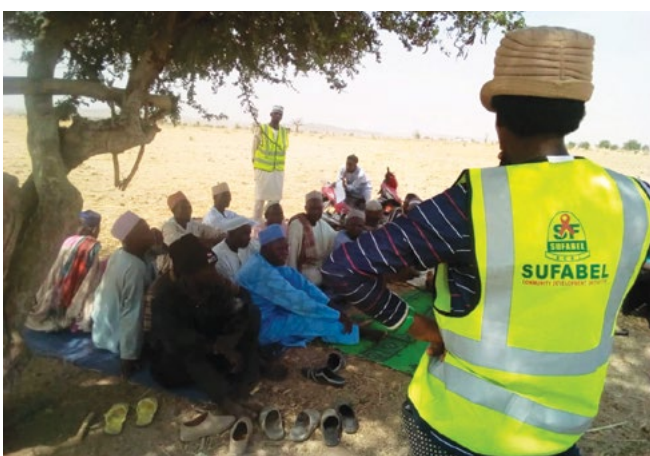
TB health education session led by SCDI

To further strengthen ownership and sustainability, an Advocacy, Communication and Social Mobilization Committee was formed, made up of the liaison officers, nomadic community leaders and representatives of the Ministry of Health, the Ministry of Finance and the local government. The Committee met with JHF quarterly to review performance and conduct targeted advocacy at state level, where updates on the progress of the intervention were regularly shared to help secure government commitment.