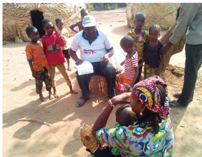
A community volunteer from JHF conducting tent-to-tent screening

Once community leaders had granted authorization, community volunteers worked in groups of two or three and visited the tents consecutively, providing screening services for household members. Each tent can house between four and six people. Each group of community volunteers could screen up to 25 tents per day, depending on household size.