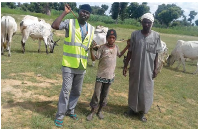
A nomadic volunteer working with his fellow community members

support from the National TB and Leprosy Training Centre, a training manual was developed, reflecting the tasks that they were expected to carry out. Community volunteers received one day of training on TB, focusing on the identification and management of people with presumptive TB, infection control, health education, and sputum collection, handling and transportation. Most community volunteers worked at least two days a week; they received monthly stipends of approximately US$ 42 and were closely supervised by the LGA TB supervisors, the liaison officers and the LGA focal points.